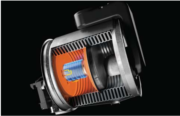
Low-emission, Viessmann-made Matrix Plus cylinder burner

The proprietary Viessmann modulating Lambda Pro Plus combustion control offers clean combustion, 10:1 turn down ratio and quiet operation with either propane or natural gas, which can be changed at the push of a button.