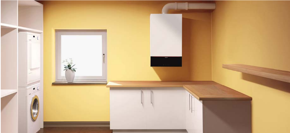
The Vitodens 100-W offers a reliable, compact solution for heating and on-demand domestic hot water (B1KE)

Equipped with a Viessmann stainless steel heat exchanger for lasting performance and reliability, plus a fully modulating Matrix Plus cylinder gas burner, the Vitodens 100-W wall-mounted gas condensing boiler is the perfect combination of value, quality and Viessmann technology.